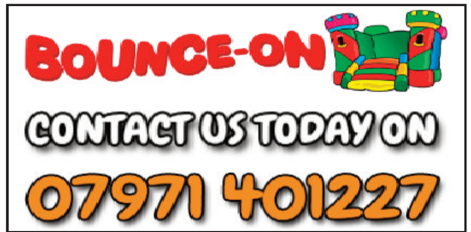
Bounce-on Bouncy Castle & Inflatables